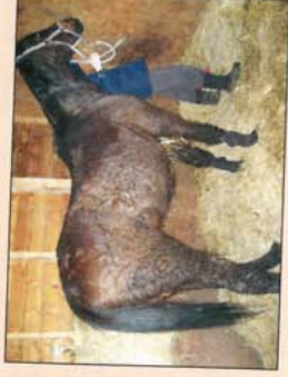
Clockwise from top: Figure 1 - Hirsutism. Figure 2 - Sweaty coat. Figure 3 - Recurrent laminitis. Figure 4 - Bulging of the supraorbital fat pad.