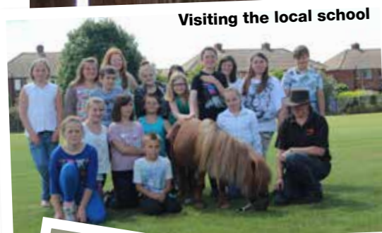
Visiting the local school

His eye was painful and his good eye was now showing signs of deterioration, too