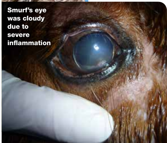
Smurf's eye was cloudy due to severe inflammation