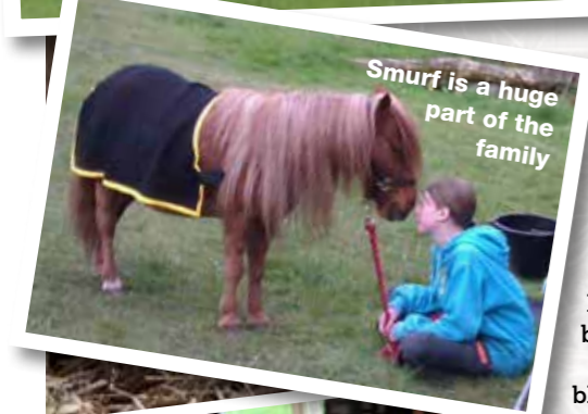
Smurf is a huge part of the family