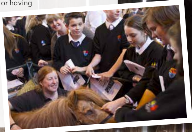
Smurf took his first day back at work in his stride

Now the stitches are out, he is going to attend his first public appearance at the local high school. He has been to this venue lots of times so should feel at home there. Our long-term plan is to raise awareness of partial sightedness, and work with young children to demonstrate how being different or having a disability is no barrier to doing something you love and being the best at what you choose to do. I think they will love our one-eyed pirate pony!