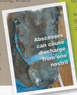
Abscesses can cause discharge from one nostril