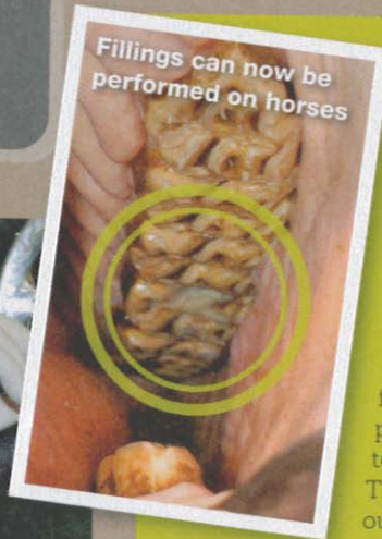
Fillings can now be performed on horses

Dental caries is dental decay in the tooth, and it can weaken the tooth and lead to fractures and tooth root infections. Caries can only be identified on a detailed oral examination. Dental fillings can now be performed on these defects to halt the decay process. The decayed tooth is drilled out, flushed and filled using specialist equipment.