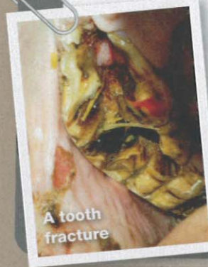
A tooth fracture

Badly fractured teeth may require extraction, but less severe cases are managed by removal of loose fragments, tetanus protection and antibiotic treatment. The opposing tooth is reduced to prevent pressure on the fractured tooth and, if necessary, the damaged tooth can be stabilised using wire bridges. A soaked concentrate diet in the short term may be necessary to allow the tooth to rest and heal.