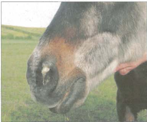
It is important to identify and respond to signs of illness quickly.

"Our veterinary farm colleagues and the medical profession are well ahead in terms of