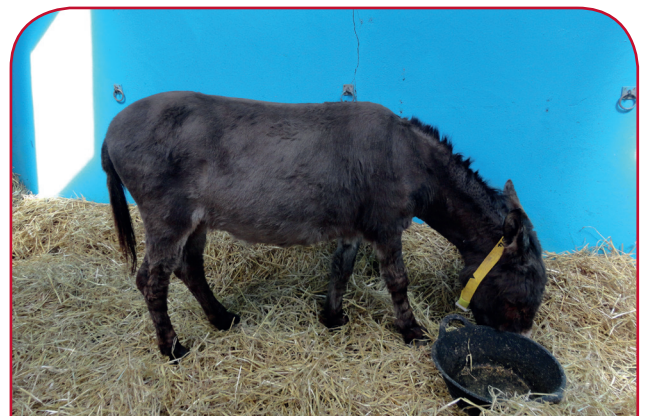
FORAGING IN BARLEY STRAW – HIGH IN FIBRE AND PREVENTS BOREDOM

A diet consisting of grass, straw and hay/haylage may be lacking in vital vitamins, minerals and proteins that a donkey needs. Addition of a multi-supplement donkey forage balancer ensures a balanced diet, without the addition of excess calories that are not required. Balancers can be fed to donkeys from the age of three weeks.