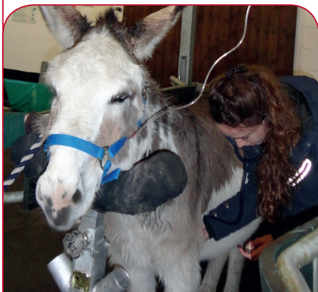
SERIOUS CASES MAY REQUIRE HOSPITALISATION AND INTENSIVE TREATMENT