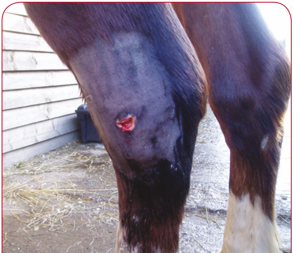
AN OPEN WOUND ON A HOCK JOINT