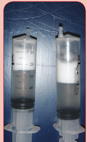
FIGURE 2: SAMPLE OF FLUID FROM THE LUNGS

Photograph of the inside of the windpipe just as it enters the lungs. The drops of mucus can be seen as lighter coloured accumulations at the bottom of the photo.