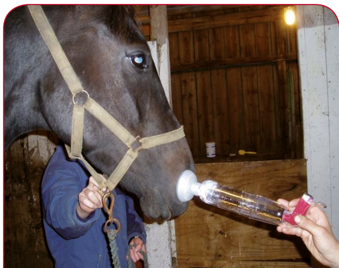
USING AN EQUINE INHALER