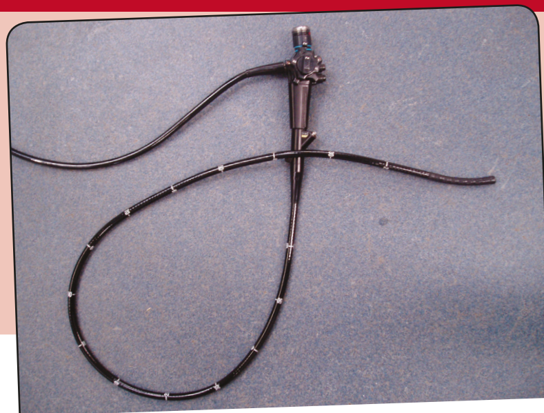
ENDOSCOPE - THIS MAY BE PASSED UP YOUR HORSE'S NOSE INTO THEIR WINDPIPE TO ASSIST DIAGNOSIS OF RAO