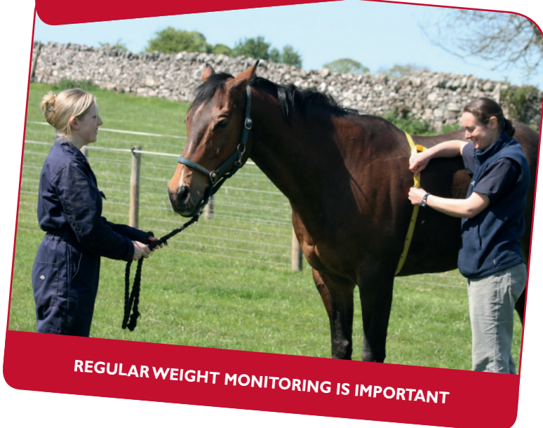
REGULAR WEIGHT MONITORING IS IMPORTANT