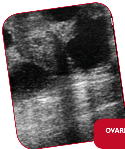
OVARIAN SCAN SHOWING FOLLICLES