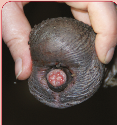
AFTER 'BEAN' REMOVAL