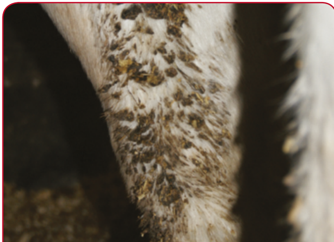
DISCHARGE ON INNER THIGH FROM DIRTY SHEATH