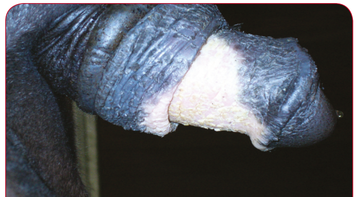
PENIS WITH NORMAL COATING OF SMEGMA