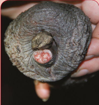
'BEAN' IN URETHRAL FOSSA