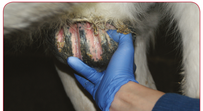
SEVERELY INFECTED SHEATH