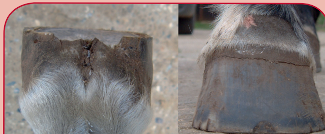
FIGURES 4 AND 5: MEDIO-LATERAL HOOF WALL ASYMMETRY AND IMBALANCE

Medio-lateral imbalance (figures 4 and 5) leads to uneven loading of the internal tissues of the foot, with the resultant accumulation of damage, causing inflammation, injury and lameness.