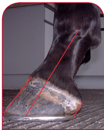
FIGURE 3: A STRAIGHT HOOF PASTERNAxis

A long toe/low heel conformation increases the loading on the back of the foot, predisposing the horse to pain, inflammation and damage to the navicular bone and