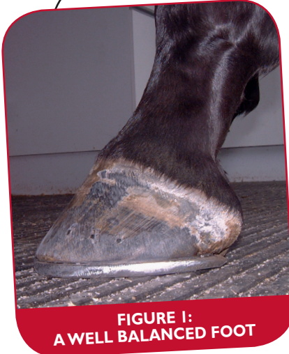
FIGURE 1: A WELL BALANCED FOOT

The modern horse we know today has evolved over millions of years, surviving quite happily without human intervention with regards to hoof maintenance. In a natural environment, horses graze varied terrain, wearing away the excess hoof growth to keep the hoof at a constant length without the need for trimming or shoeing.