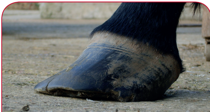
FIGURE 2: AN OVERGROWN FOOT WITH A LONG TOE AND DISTORTED HOOF CAPSULE

This means that as the hoof grows longer it also grows more forward, thus increasing the overall length from the fetlock (figure 2). Significant increases in length and/or distortion of the foot shape can result in lameness both from within the hoof and structures further up the limb. Regular trimming and correction of distortions is vitally important for maintaining soundness.