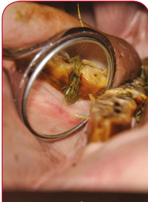
A DIASTEMA CONTAINING FOOD MATERIAL

A diastema is a gap between the molar teeth into which food packs causing painful gum infection known as periodontal disease. There are many causes including overcrowding, poor tooth compression and displaced teeth. Signs seen include bad breath (halitosis), quidding (dropping food), weight loss and pouching of food in the cheeks. Affected horses are also more likely to develop choke and impaction colic due to poor chewing of fibre.