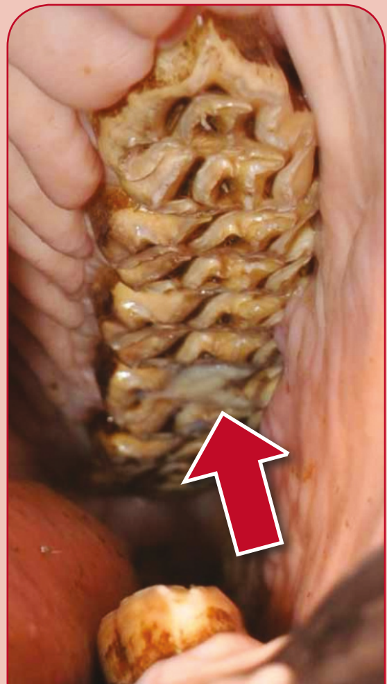
FILLING OF UPPER CHEEK TOOTH

The decayed tooth is drilled out, flushed and filled using specialist equipment.