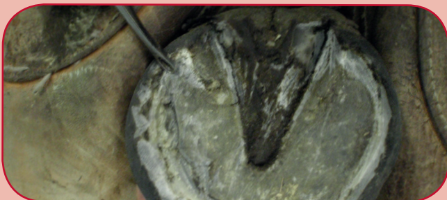
Paring the superficial layers of sole may reveal the discolouration of a bruise.