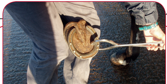
CHECKING FOR SOLAR PAIN USING HOOF TESTERS