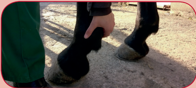
Checking for a digital pulse using finger and thumb towards the back of the fetlock joint on either side.